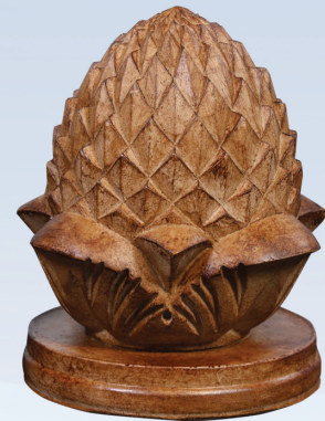
Smooth-Cast® 320 with Urefil® 5