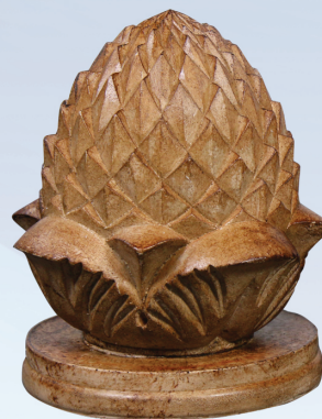
Original Wooden Model